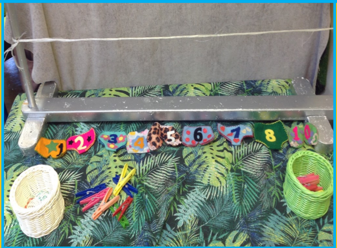
Washing line game – To encourage number recognition and ordering number to 10