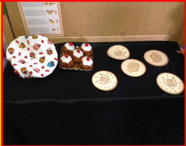
Five currant buns in the baker shop – Game designed to prompt math's and singing