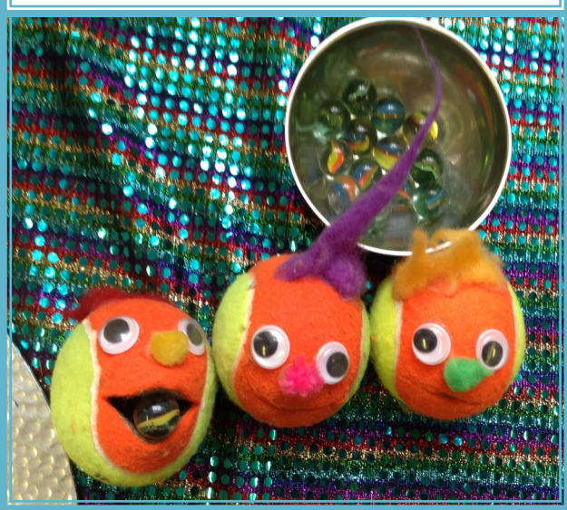
Munchie monsters – To prompt fine motor development